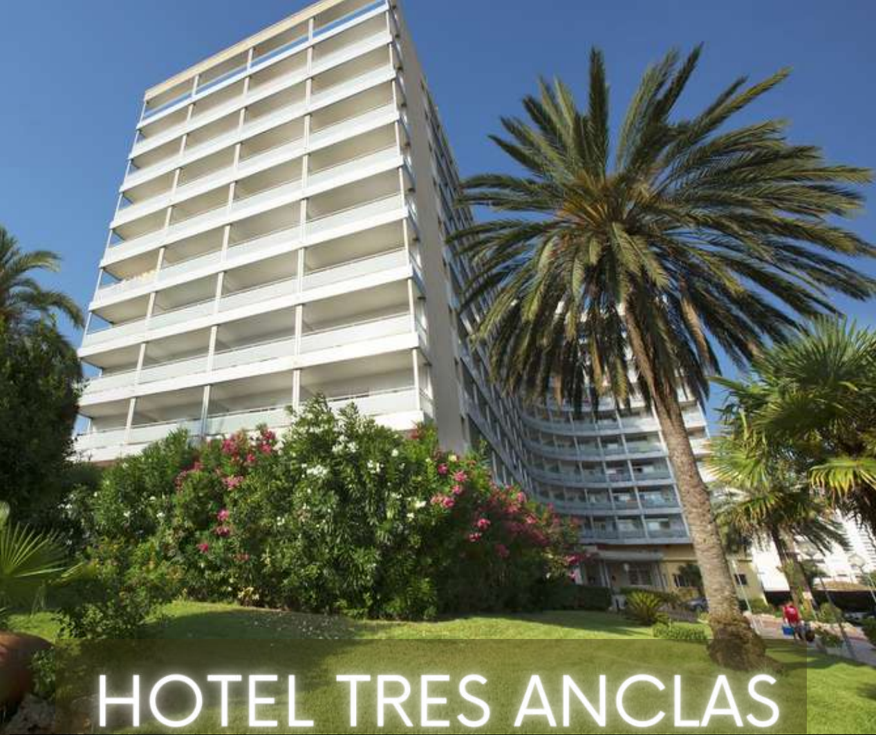
HOTEL TRES ANCLAS